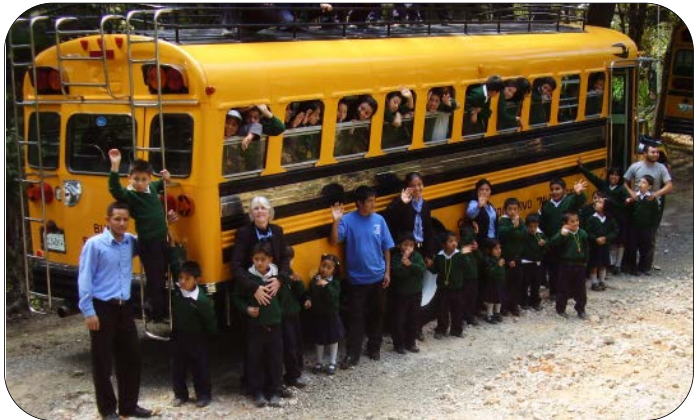
Clockwise from top: Volunteers have been involved with carpentry, dentistry, computers, sewing and medical outreaches. Above: The kids going back to the garbage dump on the school bus.